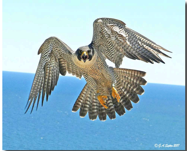
Above: Valcor Below: Her 4 youngsters

Eggs: 4 between April 9 – 15 Projected Hatch Dates: May 17 – 19 Eggs Hatched: 4 between May 17 - 19 Banded: 4 males on June 6 Site Visits: February 20, June 6