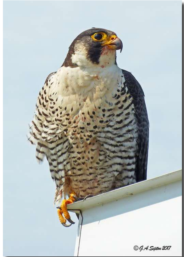
Above: The unbanded adult female Below: Her 4 young

This site has been active since 2009 producing a total of 34 young (3.8/year).