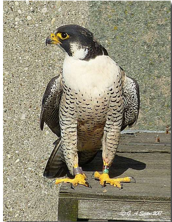
Above: Amylase Below: The 2 youngsters on banding

Eggs: 4 between March 22 – 29 Projected Hatch Dates: April 29 – May 1 Eggs Hatched: 2 between April 29 – May 2 Banded: 1 female & 1 male on May 22 Site Visits: March 10, May 22