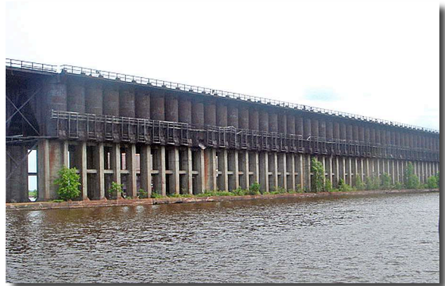
Above: The abandoned ore dock

GPS: 46 Degrees 70’ 17 N, 92 Degrees 02’ 63 W