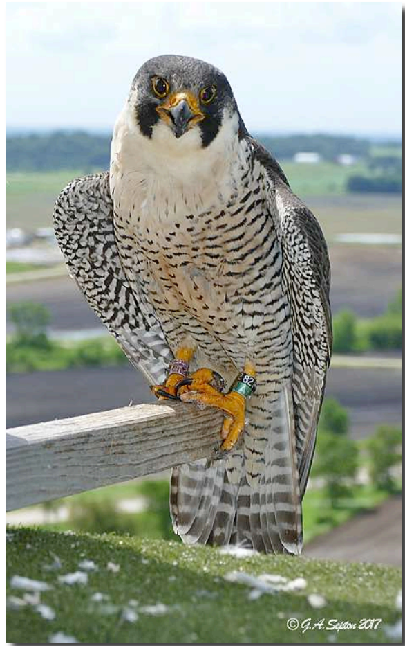
Above: Smokey at her nest box