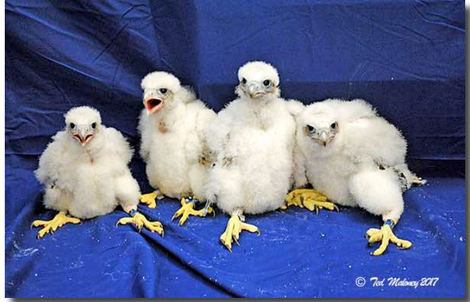
Above: Banding day

This site has been active since 2001 producing a total of 41 young (2.41/year).