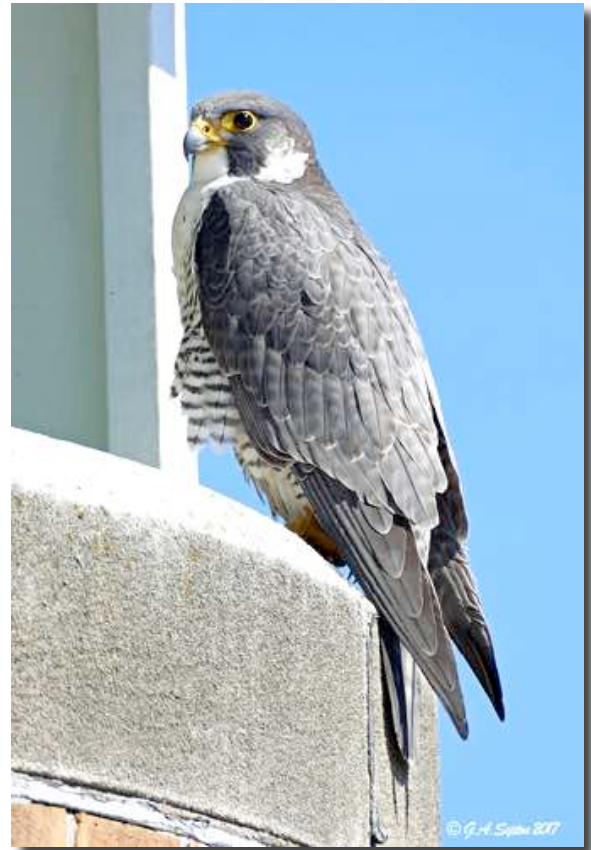
Above: The unbanded adult female peregrine at Milwaukee's Miller Coors nest site

We Energies Wisconsin Energy Foundation US Bank-Milwaukee Malteurop North America, Inc. Veolia Water Miller Coors Brewing Briess Malt & Ingredient Co. Wisconsin Power & Light Wisconsin Public Service Raptor Education Group, Inc. The Raptor Center Alliant Energy Raptor Resource Project Fellow Mortals Madison Gas & Electric Wheaton Franciscan Hospitals United Hospital System Valero Renewables Pineview Wildlife Rehab Center St. Josephs Hospital - Milwaukee Kenosha Medical Center Milwaukee Regional Medical Center - Thermal Ever-Green Energy, LLC Proctor & Gamble Paper Products S.O.A.R Sports Turf Warehouse Racine County Thilmany Mill ThyssenKrupp STCP Ltd Georgia Pacific USDA UW - Milwaukee UW - Oshkosh UW - Green Bay WI DNR WI DOT Wildlife in Need Center Wildlife of Wisconsin Willowbrook Wildlife Haven AVES Wisconsin Humane Society Dominion Energy Wausau Paper Wisconsin Falconers Association Wisconsin Society for Ornithology