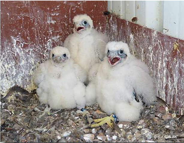
Below: Her 3 young after banding

This site has been active since 2006 producing a total of 28 young (2.33/yr.).