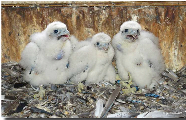
Below: Her 3 youngsters

This site has been active since 2008 producing a total of 29 young (2.9/yr.).