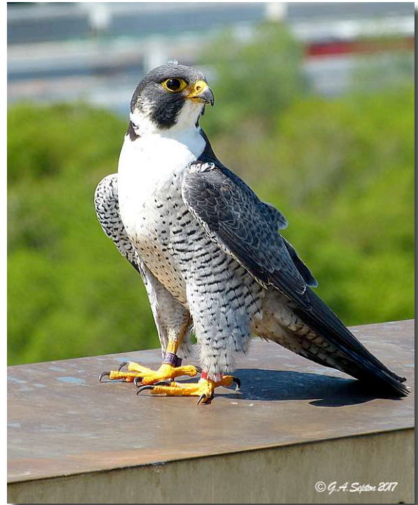
Above: Hercules at his nest box