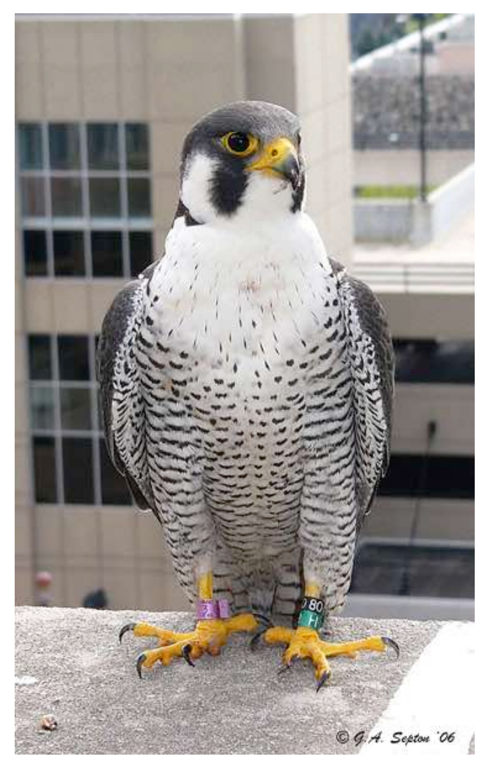
"Aaron" at the Kenosha Medical Center nest site

This year in Wisconsin there were 21 successful peregrine nests that produced a total of 65 young (3.09 yng./nest). Eleven nests were located along the Lake Michigan shoreline. There were also 7 nests along the Mississippi River (3 on cliffs), 2 inland nests and 1 nest in the Fox Valley.