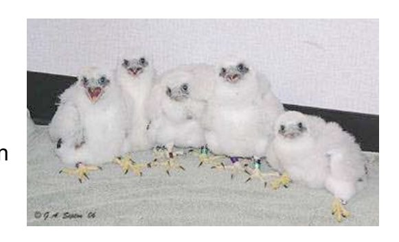
Five males on banding day