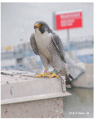
Darrel perched near his nest ledge

Eggs: 4 Laid between March 29 – April 4 Projected Hatch Dates: May 5 – 7 Eggs Hatched: 3 Between May 5 - 7 NOTE: On May 11 a storm flooded the nest ledge and all 3 chicks were lost. Plans are underway to modify this ledge as well as install a nest box.